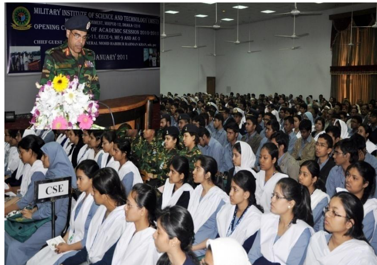
ORIENTATION OF NEW INTAKES