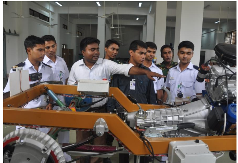
MACHINE TOOLS LAB