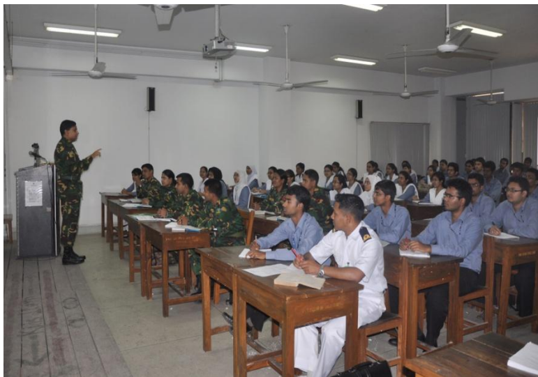
CLASS IN PROGRESS