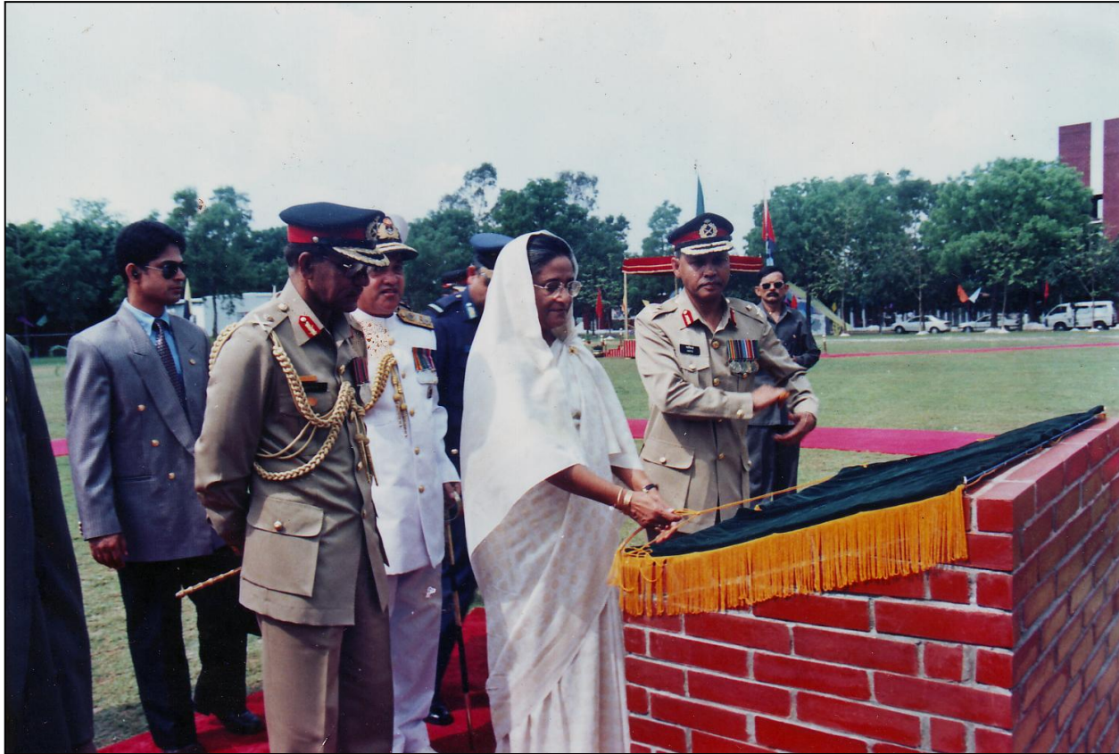
INAUGURAL CEREMONY OF MIST- 19 APRIL 1998 HONOURABLE PRIME MINISTER OF PEOPLE'S REPUBLIC OF BANGLADESH SHEIKH HASINA UNVEILLING THE FOUNDATION PLAQUE