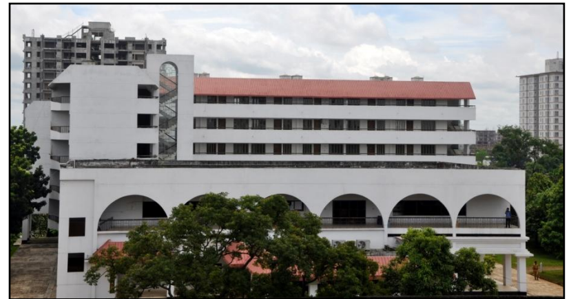
STUDENT OFFRS' MESS