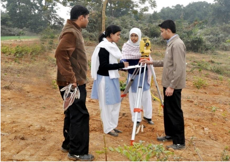
SURVEYING AT MIST