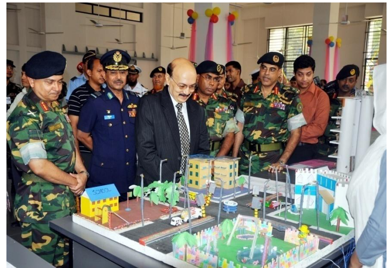
STUDENTS' PROJECT FAIR