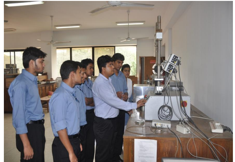
GEO-TECHNICAL ENGINEERING LAB