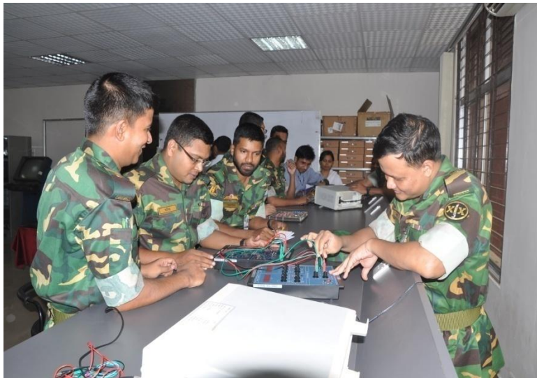
DIGITAL ELECTRONIC LAB