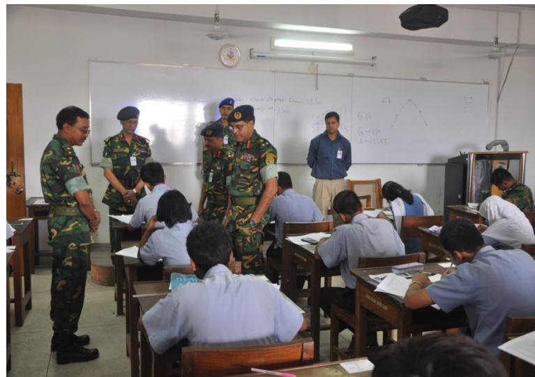
EXAM IN PROGRESS