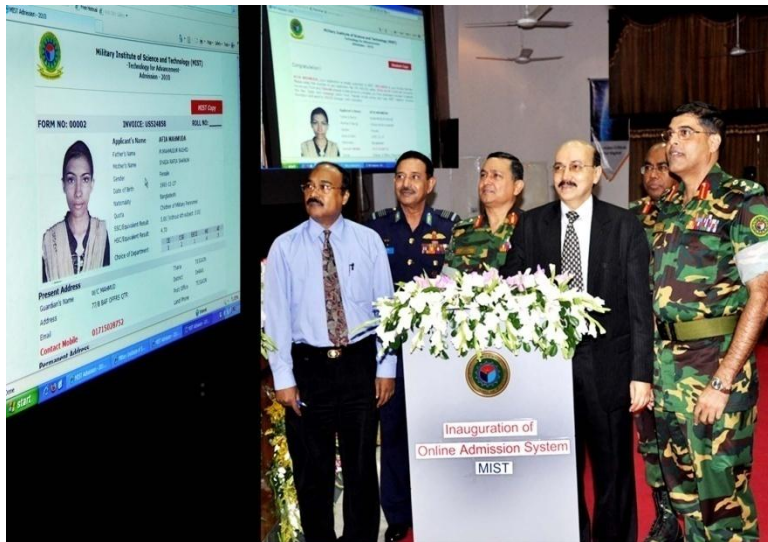
INAUGURATION OF ONLINE ADMISSION SYSTEM