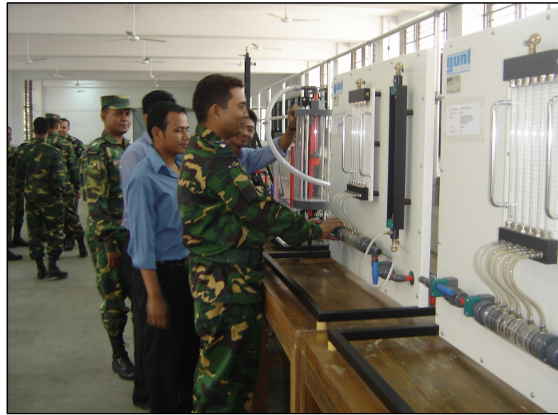
WATER RESOURCE LAB