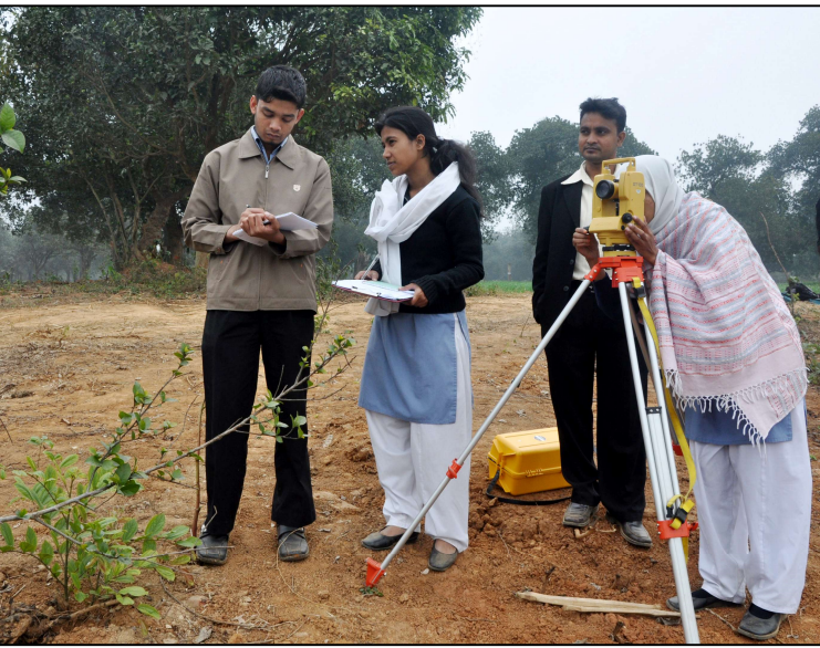
SURVEYING AT MIST