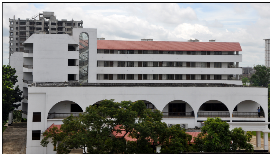
STUDENTS' OFFERS MESS