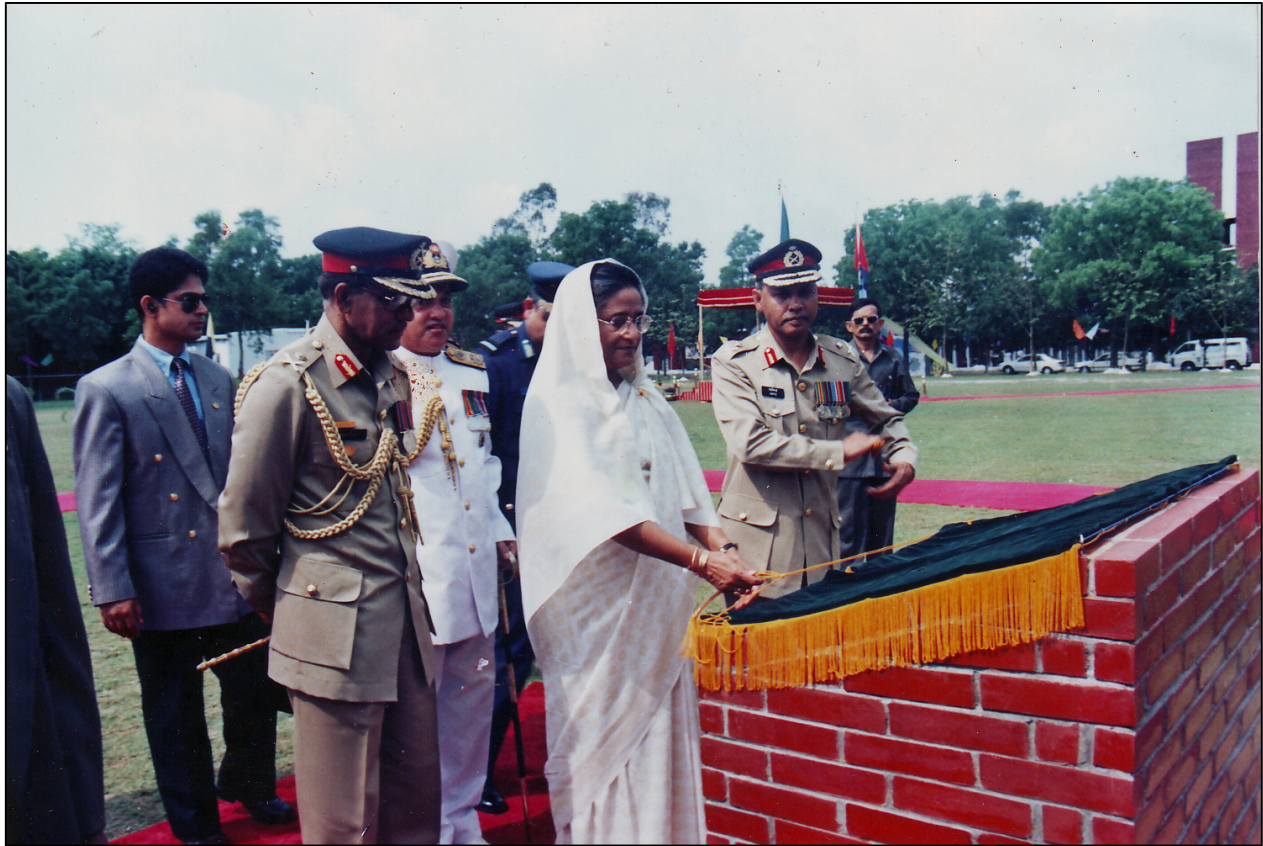
INAUGURAL CEREMONY OF MIST- 19 APRIL 1998 HONOURABLE PRIME MINISTER OF PEOPLE'S REPUBLIC OF BANGLADESH SHEIKH HASINA UNVEILLING THE FOUNDATION PLAQUE