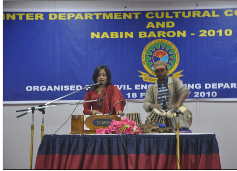
SPORTS AND CULTURAL COMPETITION