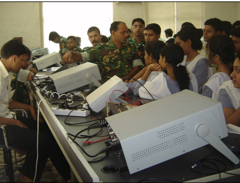
DIGITAL ELECTRONIC LAB