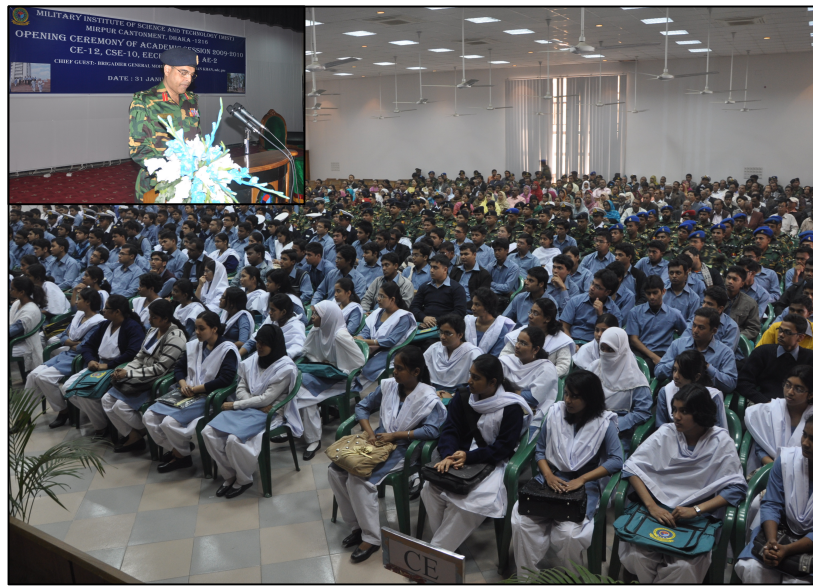
ORIENTATION OF NEW INTAKES