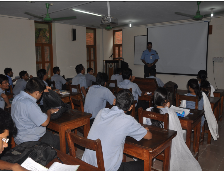
CLASS IN PROGRESS