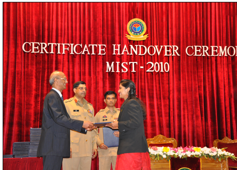
CERTIFICATE HANDOVER CEREMONY