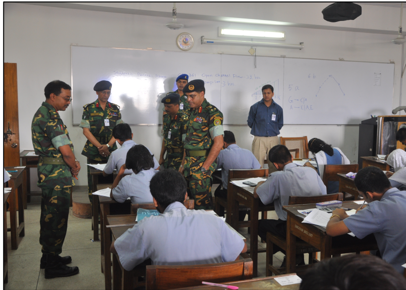
EXAM IN PROGRESS