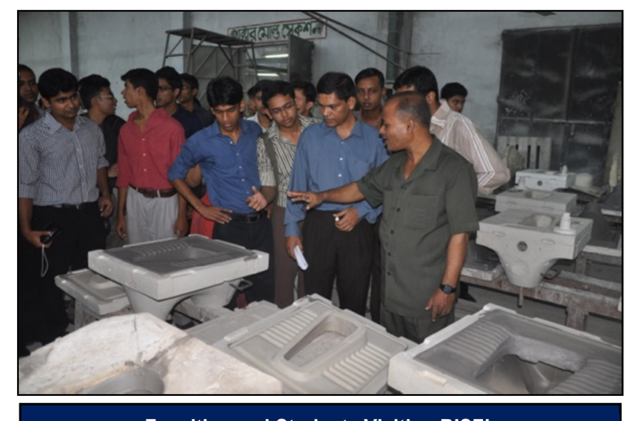
Faculties and Students Visiting BISFL

MIST faculty members and students of ME-7, Level -1 from the Department of Mechanical Engineering (ME) visited Bangladesh Insulator and Sanitary Factory Limited (BISFL) at Mirpur on 17 October 2009.