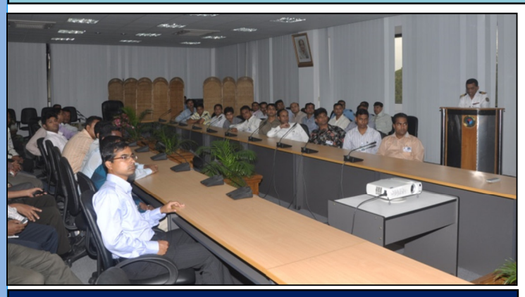
Visiting Team of Bsc-54