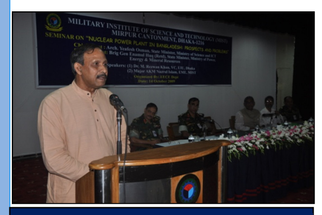
Chief Guest Delivering His Speech