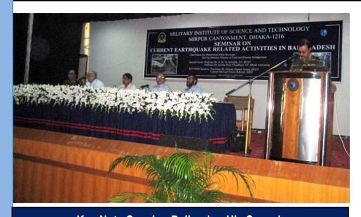
Key Note Speaker Delivering His Speech