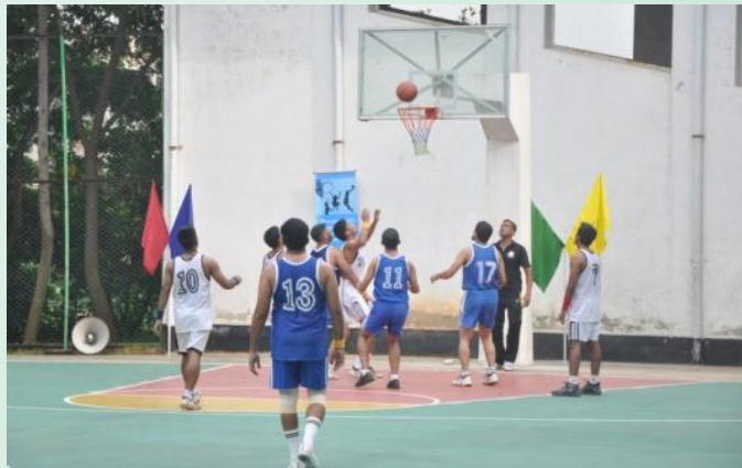
A moment of the final match