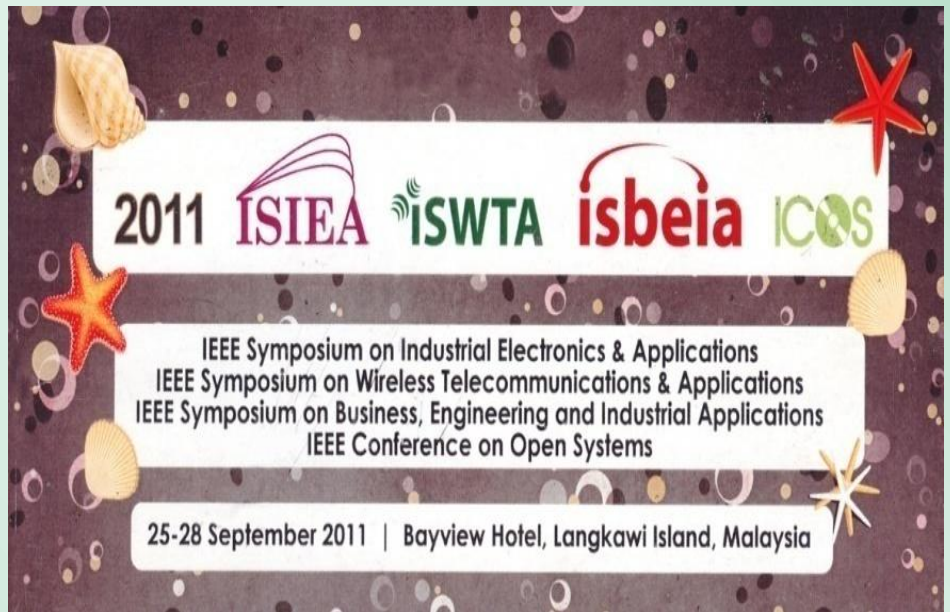
Symposium Program Book

Commander M Mahabubur Rahman, (L), psc, BN, Instructor Class- A, EECE Department, attended an international symposium on 'Industrial Electronics and Applications (ISIEA)-2011' held in Malaysia during the period 25 to 28 Sep 2011. He presented a research paper titled 'Performance Analysis of a Power Line Communication System Over a Non-White Additive Gaussian Noise Channel'.