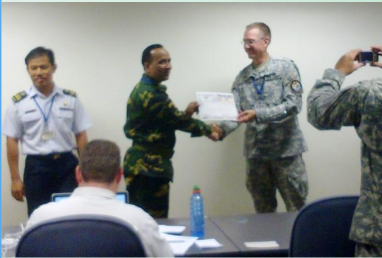
Delegation of MIST receiving certificate