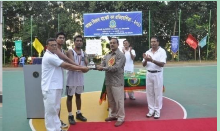
Comdt with the champion team

Inter-Department Basketball Tournament-2011 was held from 24 to 28 Jul 2011. It was organized by CSE Department. A total of 05 teams participated in this tournament.