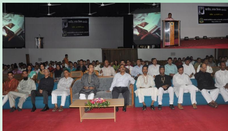
Documentary film show

To mark the 36th death anniversary of the Father of the Nation Bangabandhu Sheikh Mujibur Rahman, MIST observed the National Mourning day on 15 Aug 2011 with due solemnity.