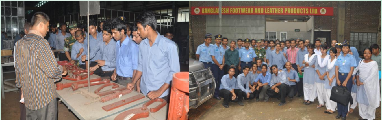
Faculties and Students Visiting 'Bangladesh Footwear and Leather Products Ltd'

Faculty members and students of level-3 from CE Department visited 'Hatirjheel Project' on 27 Sep 2011. This road would connect Kazi Nazrul Islam Avenue with Shaheed Tazuddin Ahmed Sharani. It is a 8 km long, 120 ft wide, 4 lane road which will ease traffic congestion of the city. Commandant MIST was present along with the visiting team.