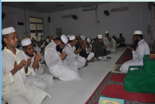
Quran khotom and special prayer