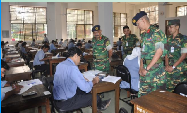
Admission test in progress

Admission Test-2011 was held on 25 Nov 2011 for 05 engineering programs: Civil Engineering (CE), Computer Science and Engineering (CSE), Electrical, Electronic and Communication Engineering (EECE), Mechanical Engineering (ME) and Aeronautical Engineering (AE). A total of 2275 short-listed candidates appeared in the admission test against 210 vacancies. It is worth mentioning that all admission related activities were carried out online.