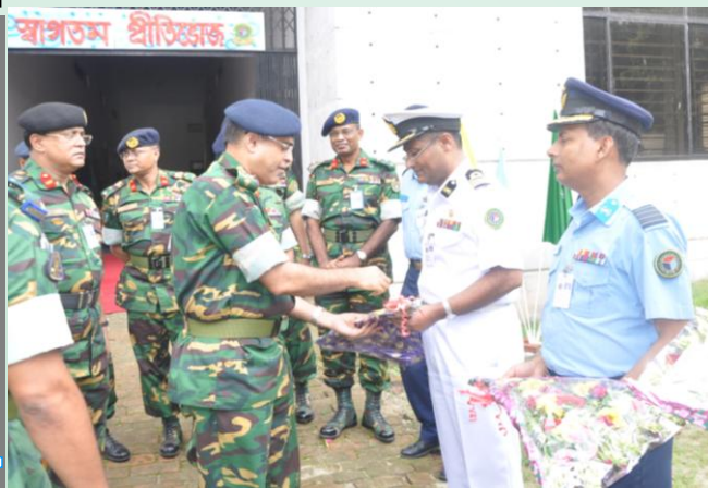
Outgoing Comdt exchanging greetings with MIST offrs