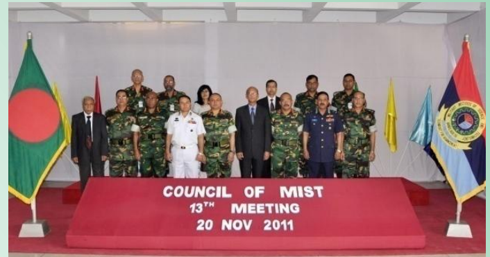
Chairman, Vice Chairman and members of the Council of MIST