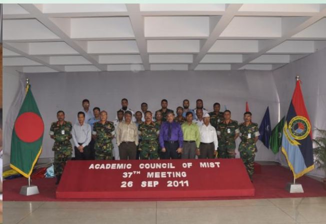
Chairman, vice chairman and members of the Academic Council of MIST

The 37th meeting of the Academic Council of MIST was held on 26 Sep 2011. Commandant MIST chaired the meeting. Representatives from University of Dhaka, BUET, Ministry of Education, Defence and Finance, Armed Forces Division, Army, Navy and Air Headquarters were present in the meeting.