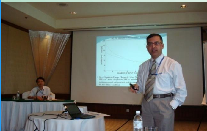
Delegation of MIST presenting his research paper