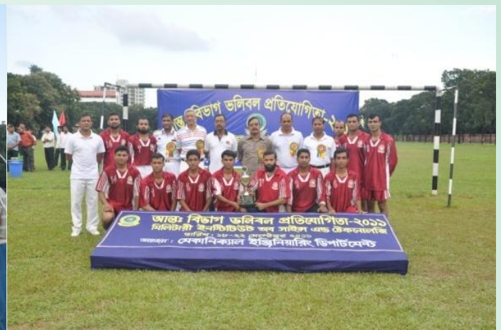
Comdt with the champion team

Inter- Department Volleyball Tournament- 2011 was held from 18 to 22 Sep 2011. It was organized by ME Department. A total of 05 teams participated in this tournament.