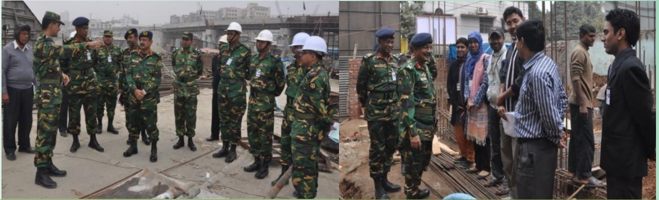
Faculties and students visiting 'Hatirjheel Project'

Faculty members and students of level-3 from CE Department visited 'Hatirjheel Project' on 27 Sep 2011. This road would connect Kazi Nazrul Islam Avenue with Shaheed Tazuddin Ahmed Sharani. It is a 8 km long, 120 ft wide, 4 lane road which will ease traffic congestion of the city. Commandant MIST was present along with the visiting team.