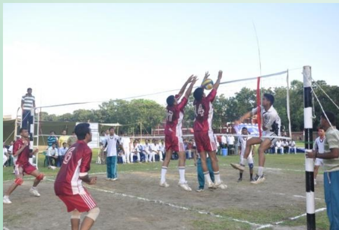
An exciting moment of the competition