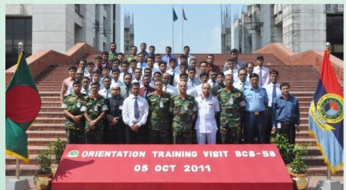
BCS-58 members with MIST faculties

A 100- member team of 58th batch of BCS Officers visited MIST on 05 Oct 2011. The team was briefed about different activities and facilities of MIST. After the briefing session, they visited MIST premises including library, classrooms, and laboratories.