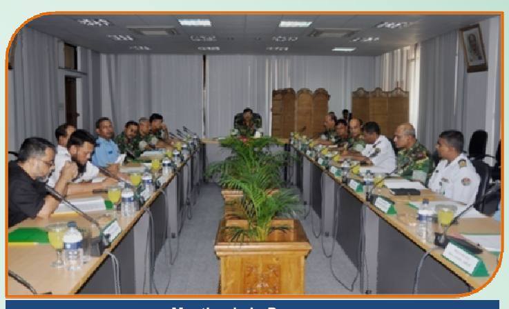
Meeting is in Progress

Various important academic related issues like withdrawal of students, inclusion Naval Architecture and Marine Engineering (NAME) Program in MIST were discussed in the meeting and appropriate decisions were taken accordingly.