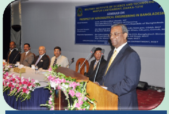
Keynote Speaker Presenting his Papers