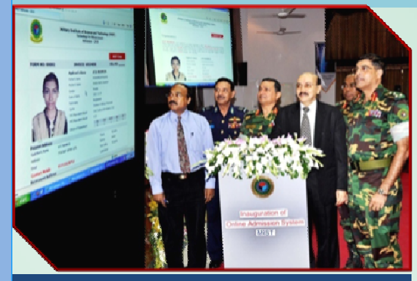
Inauguration of Online Admission System by Chief Guest