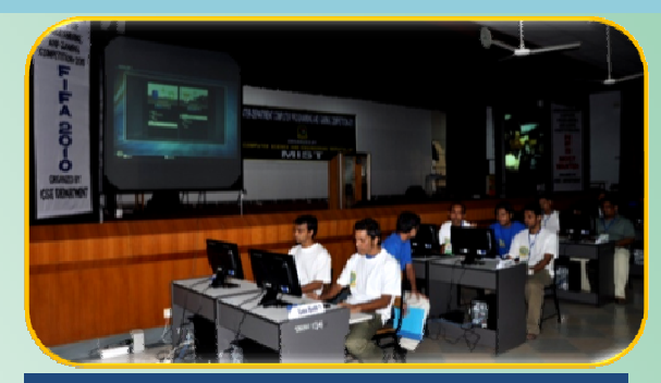
Participants of the Competition

Inter-Department Computer programming & gaming competition 2010 was held at MIST from 26 August to 31 August 2010. A Total of 05 teams participated in the competition. Department of Computer Science & Engineering (CSE) & Department of Electrical, Electronic and Communication Engineering (EECE) became the champion & runner-up respectively.