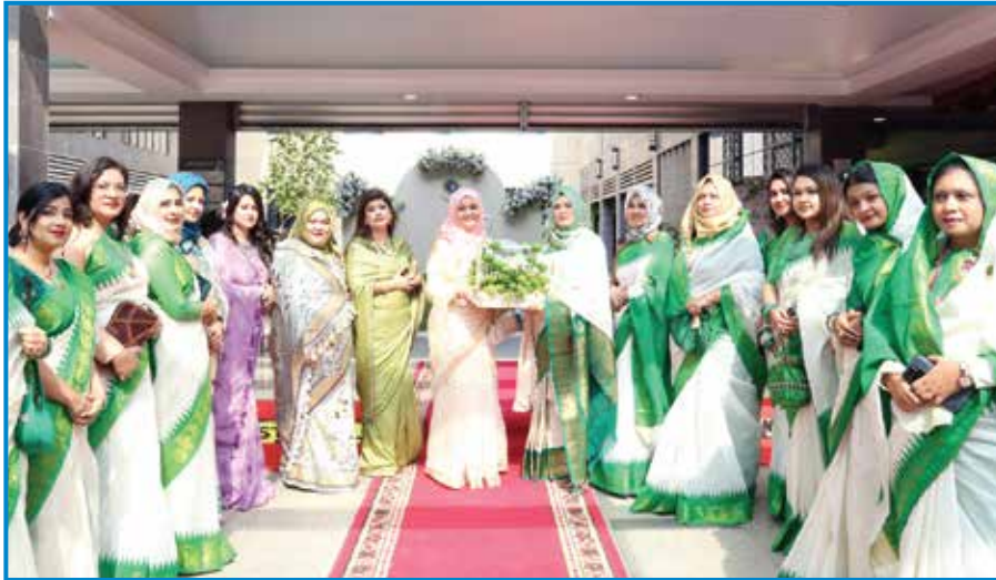
Respected CAS Madam is received with a flower bouquet at the Central Ladies Club Program organized by MIST on 12 November 2023.