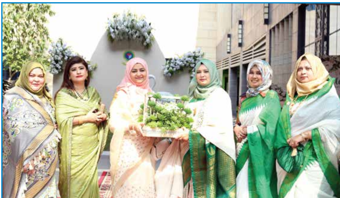
Respected CAS Madam is warmly received at the Central Ladies Club program organized by MIST at Army Officers Club on 12 November 2023.