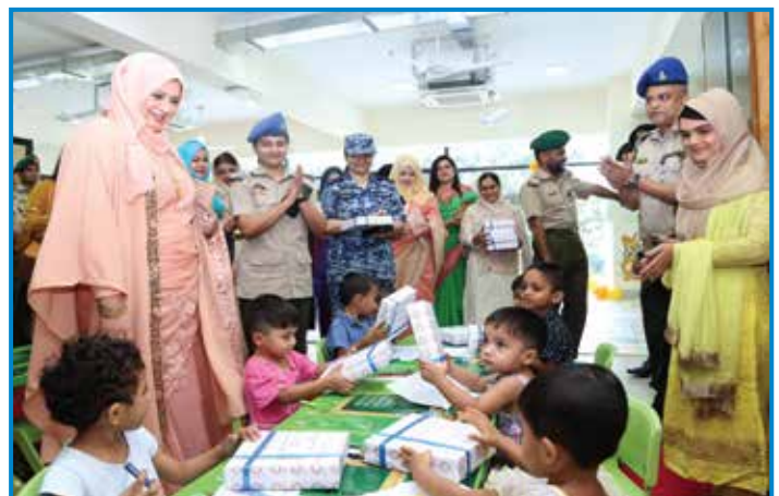
Commandant Madam, MIST visited MIST Central Library to observe the facilities provided to the students and faculties. She also visited MIST Day Care Centre and interacted with the children.