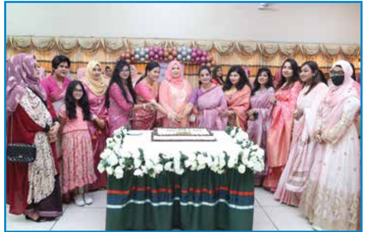
Commandant Madam, MIST is warmly received by the members of MIST Ladies Club. The program was organized on the occasion of Commandant Madam's arrival as new guardian of MIST Ladies Community.