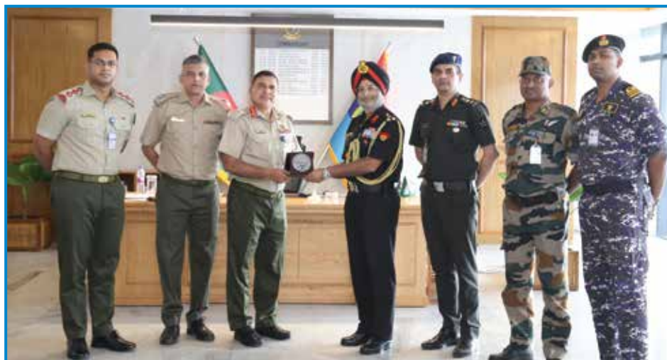
Call on of Defence Advisor, Indian High Commission on 09 November 2023