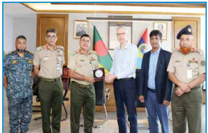
Call on of Russian Delegation Team with Commandant, MIST on 30 November 2023