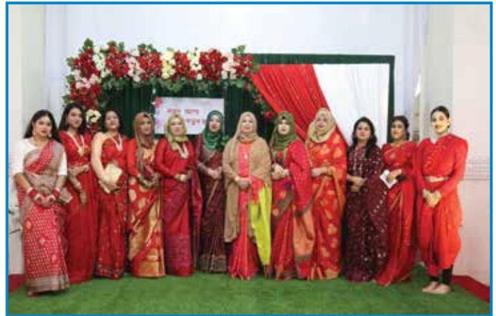
A social evening followed by a cultural program was held at multipurpose hall of MIST organized by MIST Ladies Club. The purpose of this program was to interact and strengthen the bonding among members of MIST families.