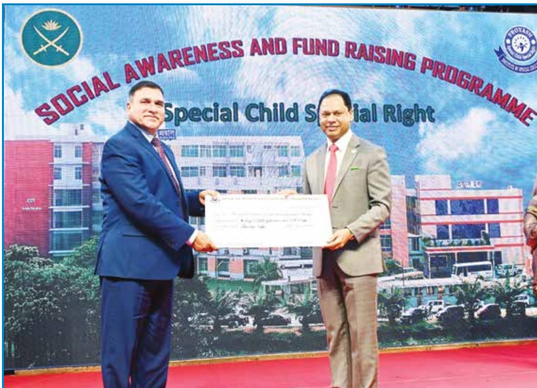
Respected CAS, General S M Shafiuddin Ahmed, SBP (BAR), OSP, ndu, psc, PhD accepting MIST's participation from Commandant, MIST in Social Awareness and Fund Raising program on 20 December 2023.