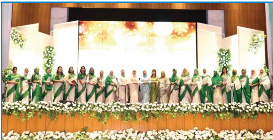
Respected CAS Madam along with members of MIST Ladies Club on the farewell program of NDC Commandant Madam, organized by MIST at Army officers Club on 12 November 2023.