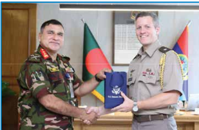
Call on of Defence Attaché, U.S. Embassy on 31 October 2023