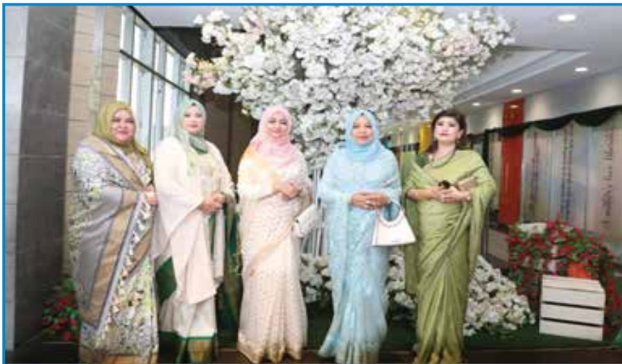
Respected CAS Madam along with senior members of Central Ladies Club at Army officers Club on 12 November.